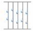
Competitors aluminum fin